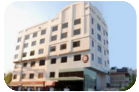
Eastin Easy Amritsar

Opening: June 2012 (rebranded) | Amritsar, India | www.eastinhotelsresidences.com